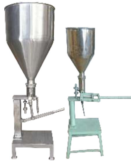
Cream Filler ▲