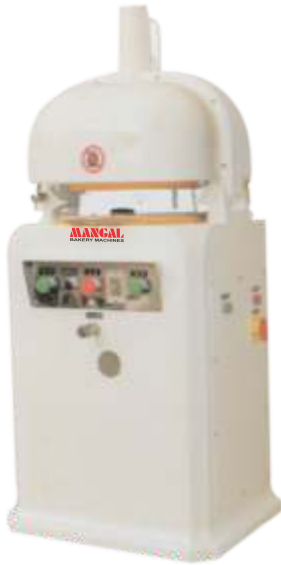
Automatic Bun Divider - Rounder TL 330 A